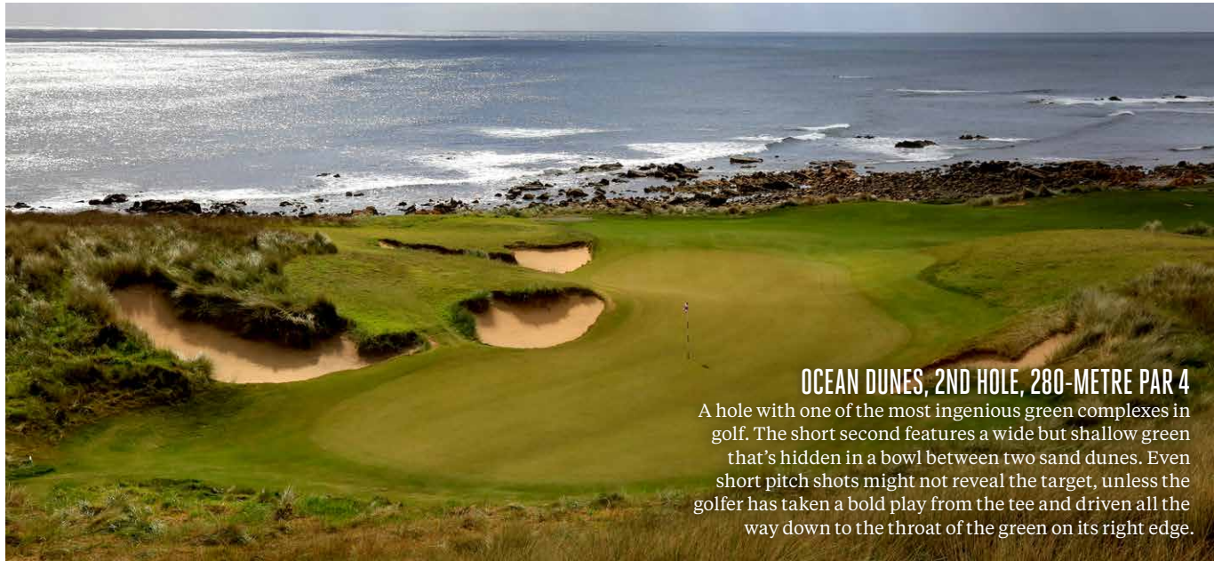
OCEAN DUNES, 2ND HOLE, 280-METRE PAR 4 A hole with one of the most ingenious green complexes in golf. The short second features a wide but shallow green that's hidden in a bowl between two sand dunes. Even short pitch shots might not reveal the target, unless the golfer has taken a bold play from the tee and driven all the way down to the throat of the green on its right edge.