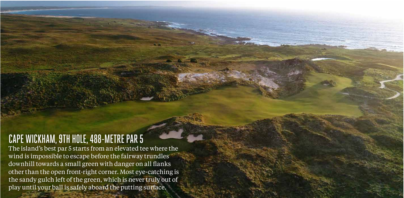
CAPE WICKHAM, 9TH HOLE, 488-METRE PAR 5 The island's best par 5 starts from an elevated tee where the wind is impossible to escape before the fairway trundles downhill towards a small green with danger on all flanks other than the open front-right corner. Most eye-catching is the sandy gulch left of the green, which is never truly out of play until your ball is safely aboard the putting surface.