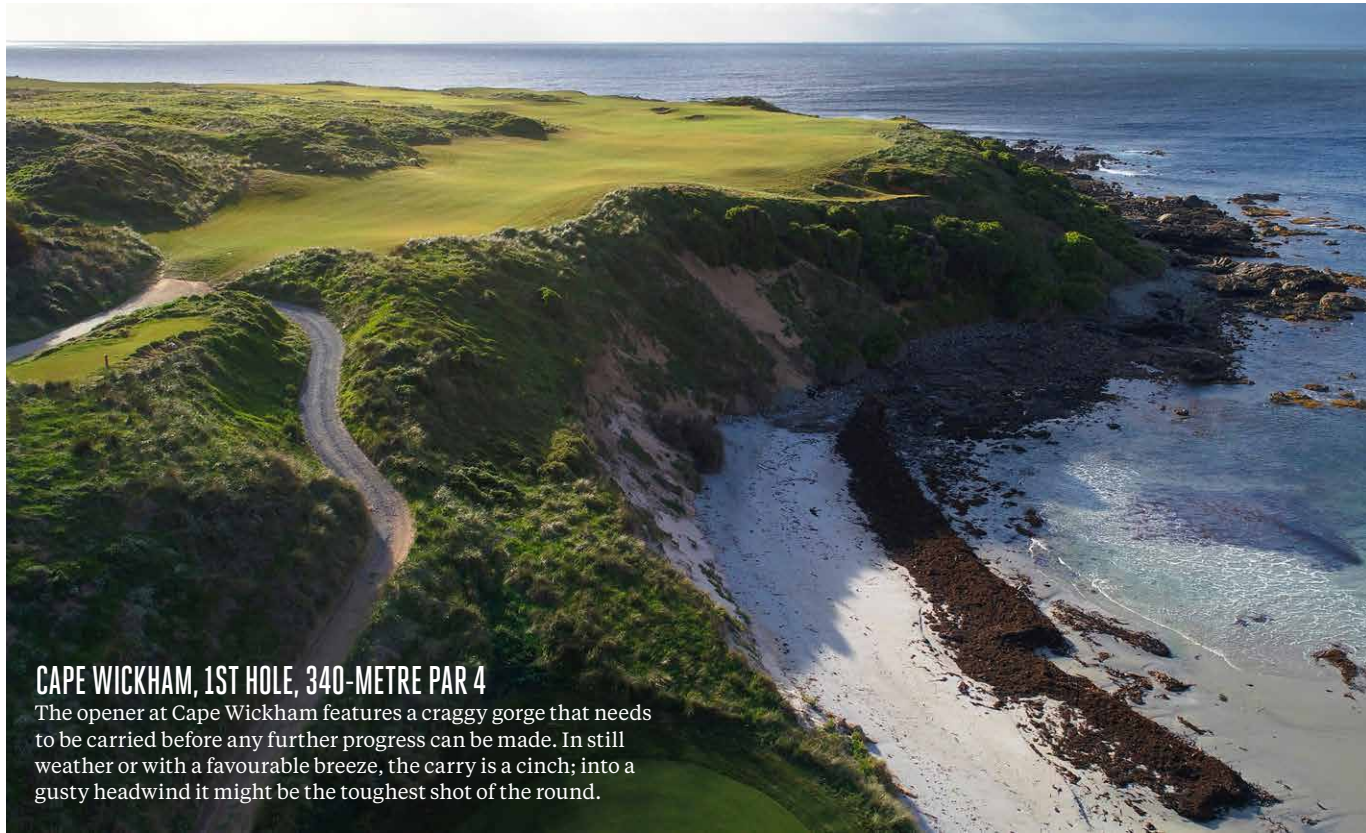
CAPE WICKHAM, 1ST HOLE, 340-METRE PAR 4 The opener at Cape Wickham features a craggy gorge that needs to be carried before any further progress can be made. In still weather or with a favourable breeze, the carry is a cinch; into a gusty headwind it might be the toughest shot of the round.

Here, in the order they fall on the respective courses, are the nine holes our judges voted as the best on King Island. Special mention goes to the short third/12th hole at King Island Golf & Bowling Club. It's a tall ask to compete with its younger siblings, but our judges didn't want the best hole at the island's original layout to be forgotten.