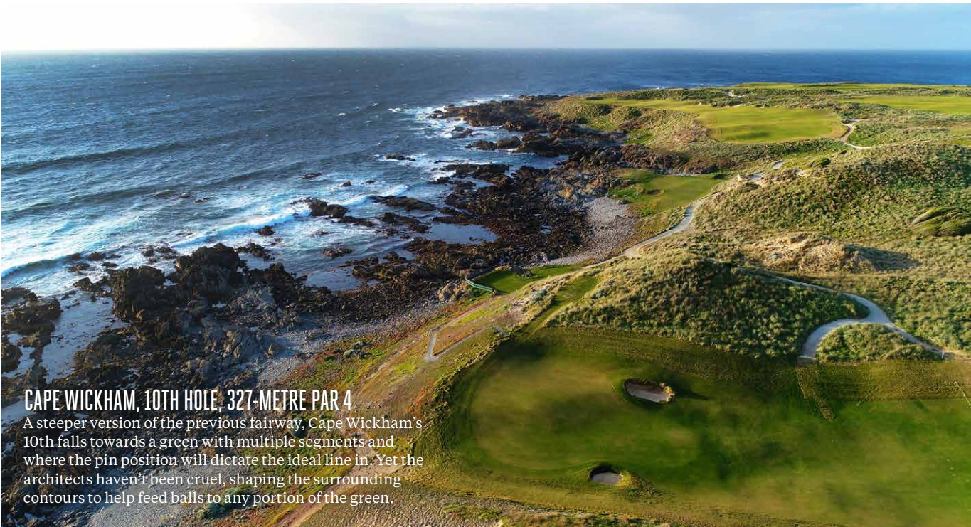
CAPE WICKHAM, 10TH HOLE, 327-METRE PAR 4 A steeper version of the previous fairway, Cape Wickham's 10th falls towards a green with multiple segments and where the pin position will dictate the ideal line in. Yet the architects haven't been cruel, shaping the surrounding contours to help feed balls to any portion of the green.