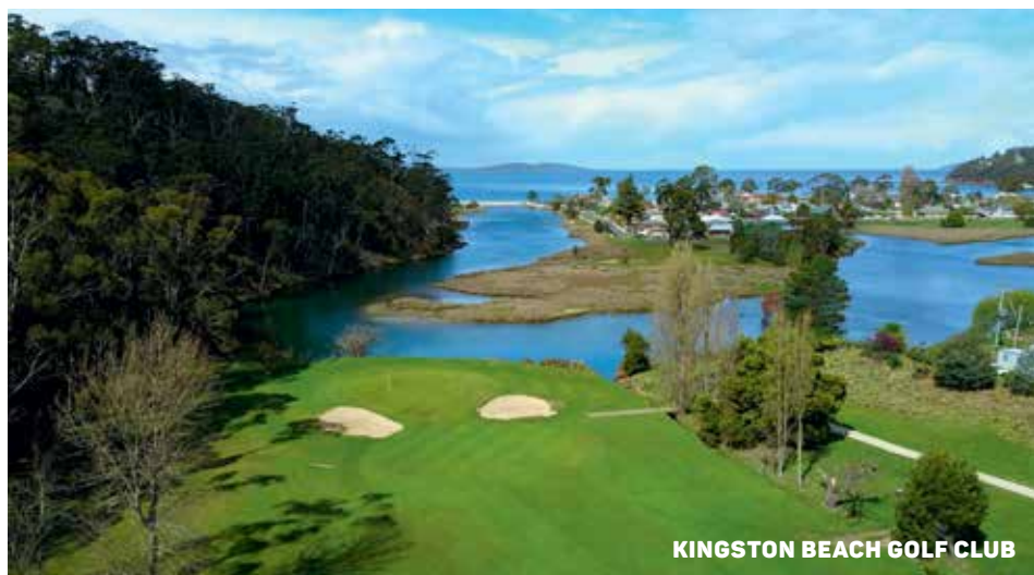
KINGSTON BEACH GOLF CLUB