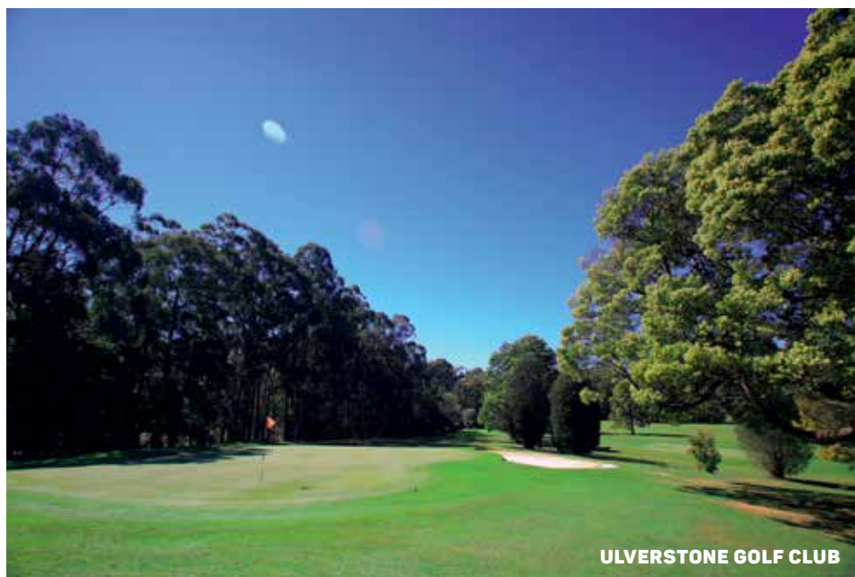
ULVERSTONE GOLF CLUB

Armchair architects will also be able to submit their 18-hole creations for a future redesign at Claremont Golf Club, about 20 minutes' drive north-west of the Hobart CBD. ►