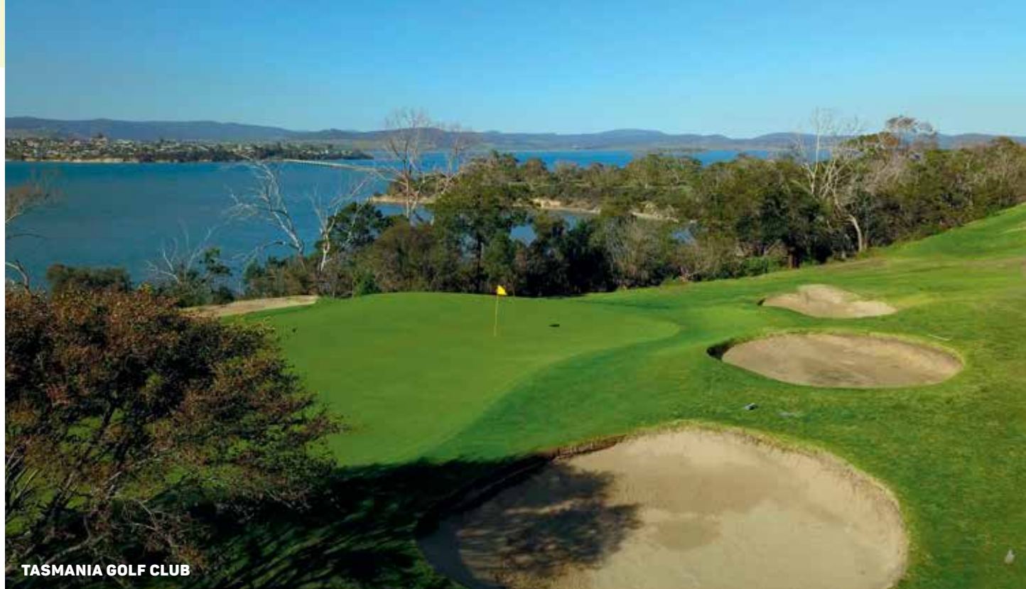
TASMANIA GOLF CLUB

produce such champion golfers is legendary but entirely understandable given the quality of the layout.