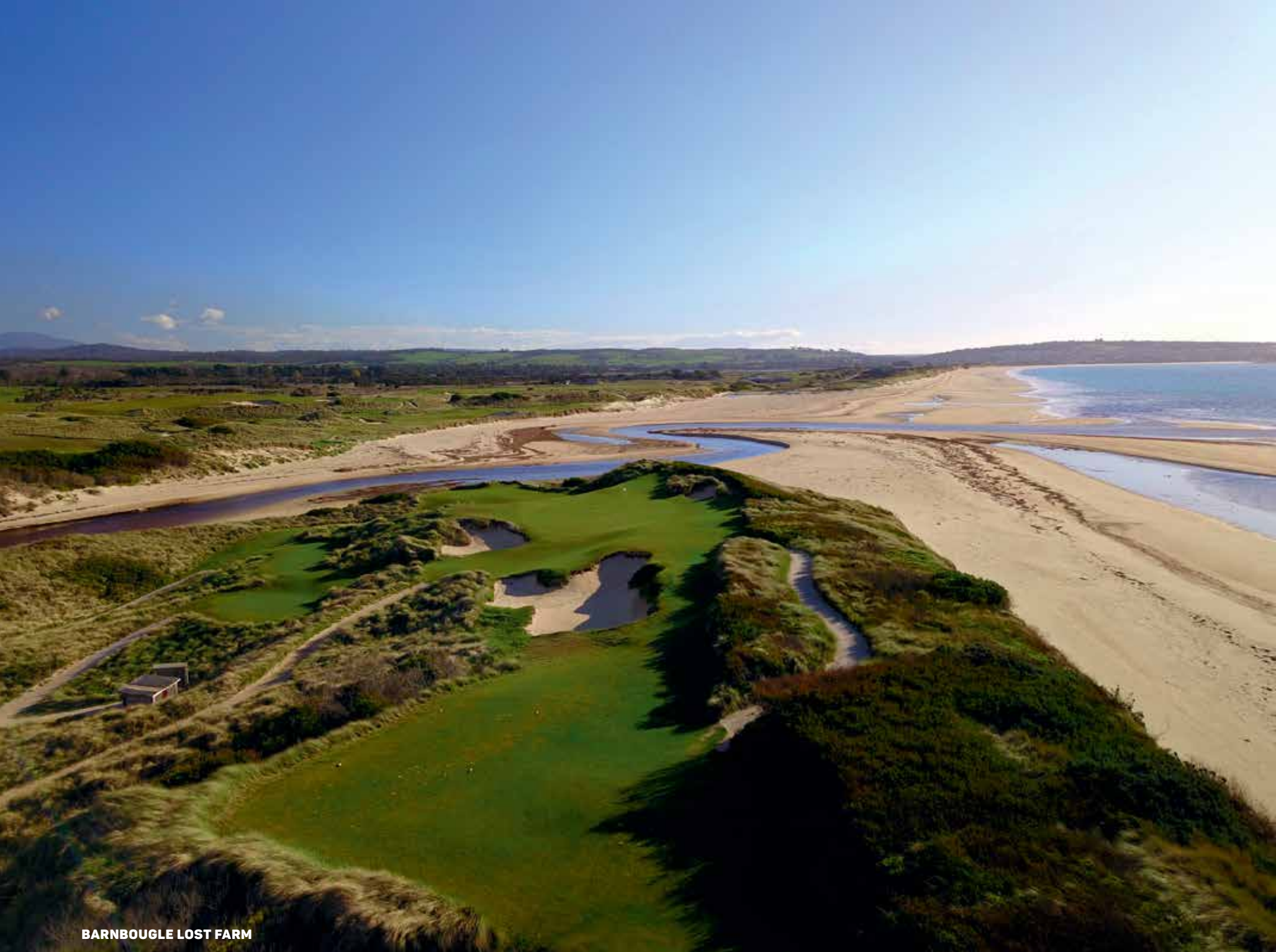
BARBOUGLE LOST FARM

in the day, with every little bump and hollow exposed by the low hanging sun, is exhilarating. It makes you feel that if all golf was like this every one would be playing.