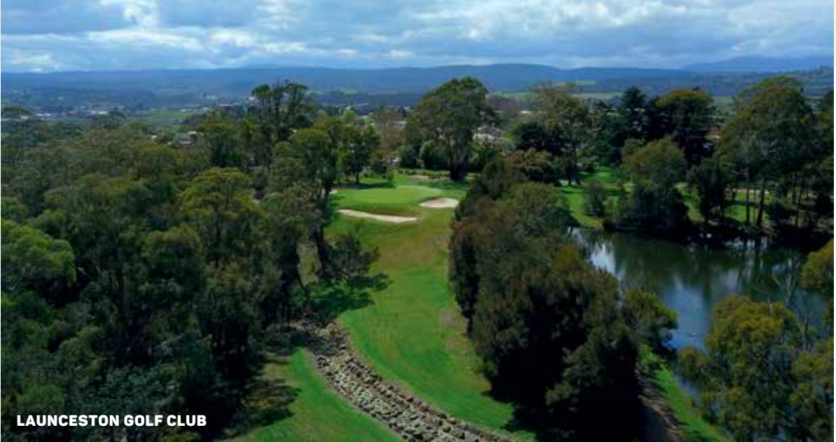
LAUNCESTON GOLF CLUB

Bunkers are the main hazard on the memorable par-3 13th, which is known as 'Spion Kop'. It is not overly long at 152 metres from the championship