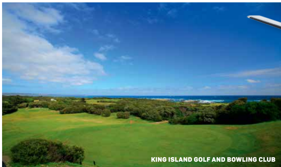
KING ISLAND GOLF AND BOWLING CLUB

“MAINTAINED BY A SMALL BUT PASSIONATE CREW OF VOLUNTEERS, KING ISLAND IS A GEM THAT LAYS CLAIM TO BEING THE BEST NINE-HOLE COURSE IN AUSTRALIA.”