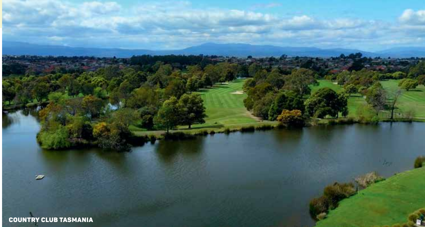
COUNTRY CLUB TASMANIA

Bowls and Croquet Club as well as the Spreyton Bowls Club to become known as the Devonport Country Club.