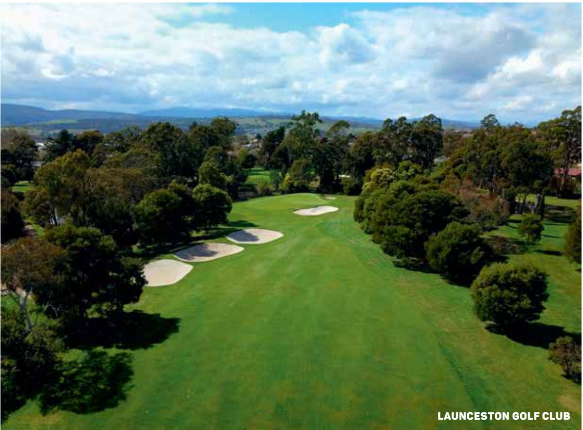
LAUNCESTON GOLF CLUB